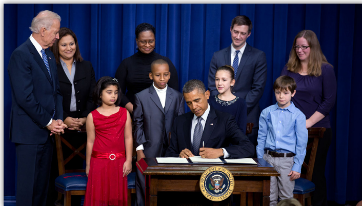
President Obama signing executive action expanding background checks.

The Democrat-controlled House passed the Bipartisan Background Checks Act in 2019, which would’ve expanded background checks to private gun sales but stalled in the Senate. Similarly, the Extreme Risk Protection Order Act aimed to incentivize state-level