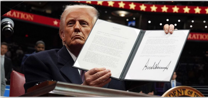
President Trump signs Second Amendment executive order.

to strengthen gun rights nationwide. More specifically, it mandated an evaluation of every firearm restriction imposed by the Biden administration, with a plan to reverse them.